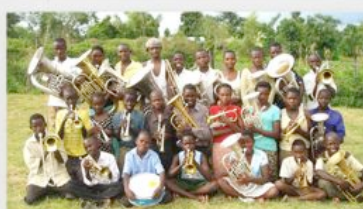
MBALE DISTRICT YOUTH BAND

Each month we're selecting one of our arrangements and donating £5 from every sale to the Mbale District Youth Band - the country's only sitting down, reading music brass band.